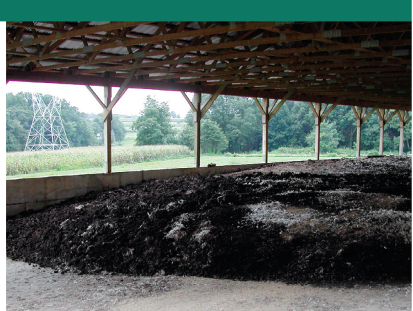
Covered manure storage on a poultry farm. The odor management regulations addressed animal housing and manure storage facilities but does not include land application of manure.