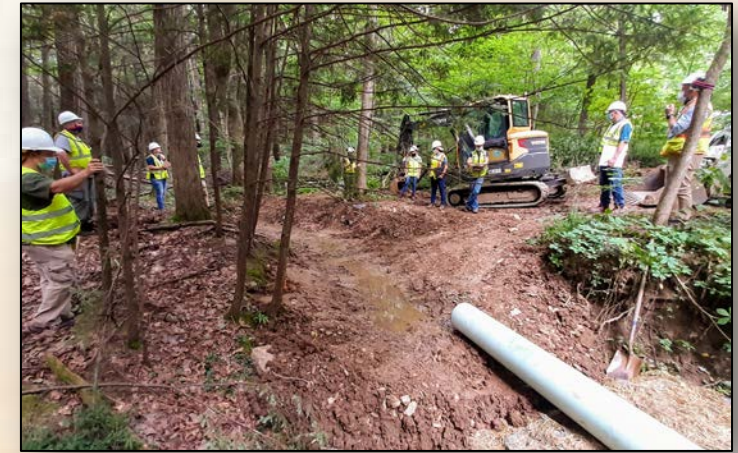
Masked and socially distanced CD staff attend a live stream crossing installation demonstration in July 2020.