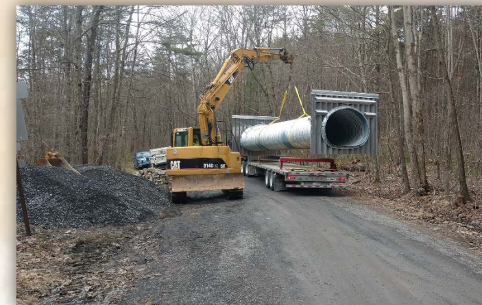
A new 6' oval pipe is lifted into place in Huntingdon County.