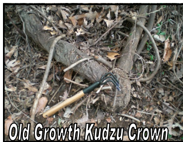
Old Growth Kudzu Crown