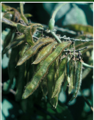
Green seed pods in late Fall in PA