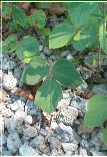
Kudzu seedlings emerge in August in PA after a heavy rain