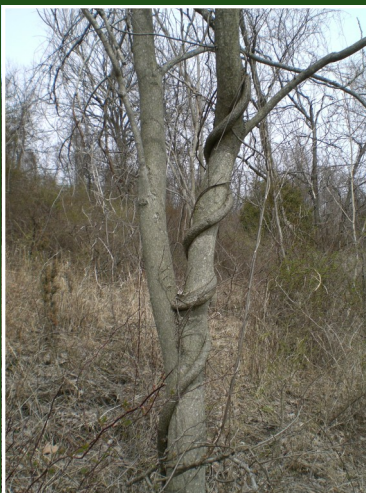
Typical kudzu strangling a tree in PA