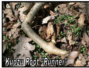
Kudzu Root "Runner"

Flowers appear in late summer as showy purple racemes and have a strong floral scent. Flowering begins in late July