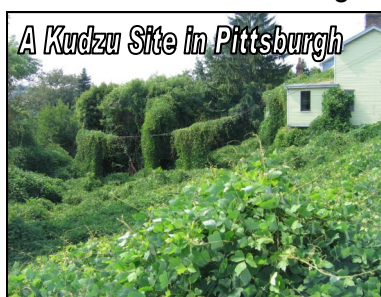
A Kudzu Site in Pittsburgh