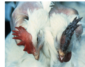
Purple discoloration of the comb could indicate HPAI.