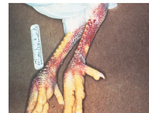
Hemorrhaging of the skin and legs is just one of the signs birds might exhibit when infected with the HPAI virus.