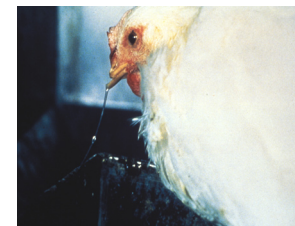
Nasal discharge (a runny nose) can be a sign of HPAI.

Biosecurity For Birds is an outreach and education campaign to raise awareness among backyard poultry owners about the steps they can take to prevent AI and other infectious poultry diseases and what to do if they suspect a disease outbreak.