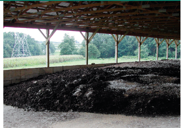
Covered manure storage on a poultry farm. The odor management regulations addressed animal housing and manure storage facilities but does not include land application of manure.

The State Conservation Commission (SCC) has issued an Odor Management Guidance document listing Odor BMPs consistent with this approach. The SCC also provides a PA Odor BMP Reference List which provides detailed information on specific Odor BMPs.