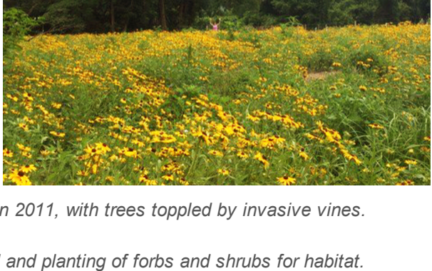
After: Mills property after invasive removal and planting of forbs and shrubs for habitat.